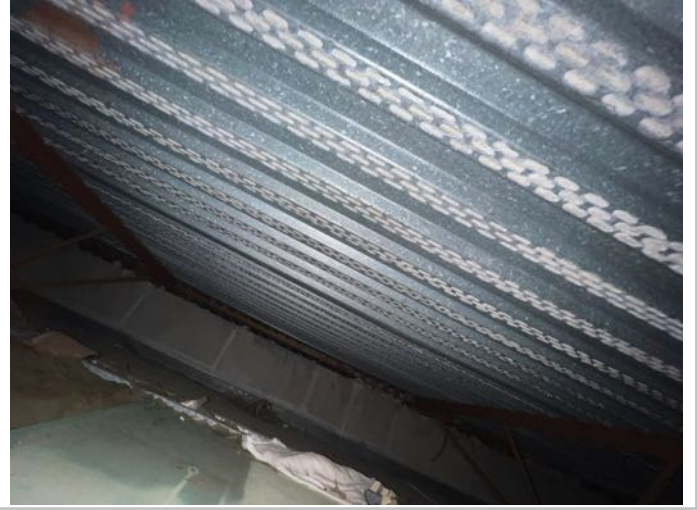
corrugated concrete deck form