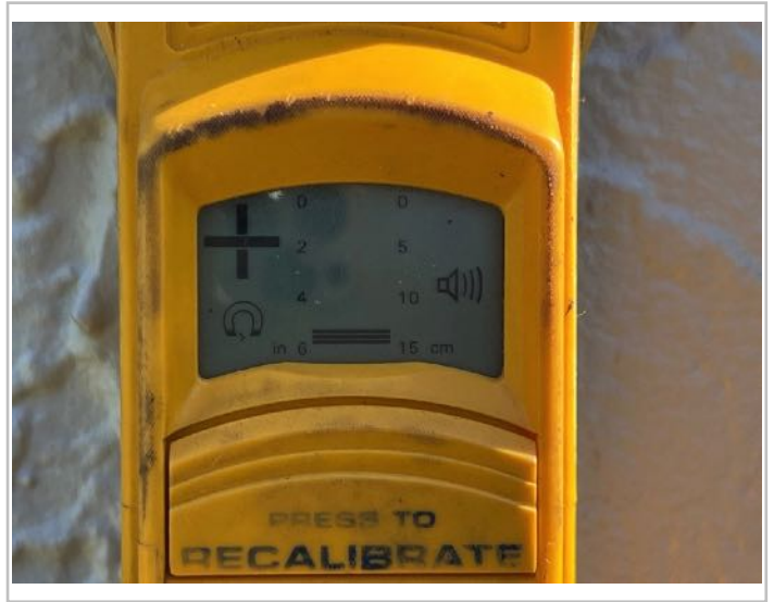
100% reinforced masonry